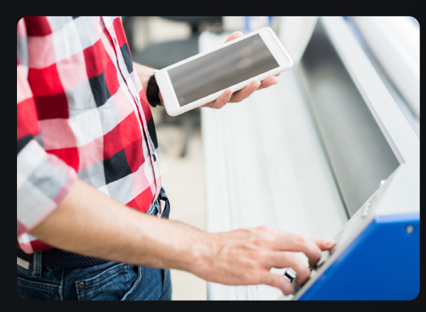
Improves customer satisfaction, efficiency, and productivity by providing faster, more accurate solutions to technical issues.