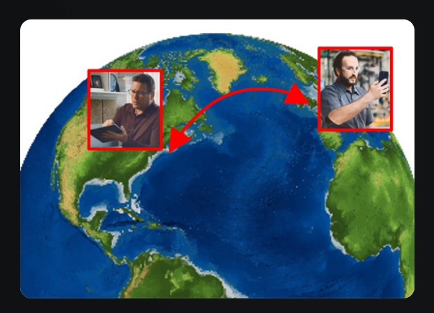
Enables remote technicians to see the issue firsthand through AR technology, allowing for precise guidance and faster issue resolution.