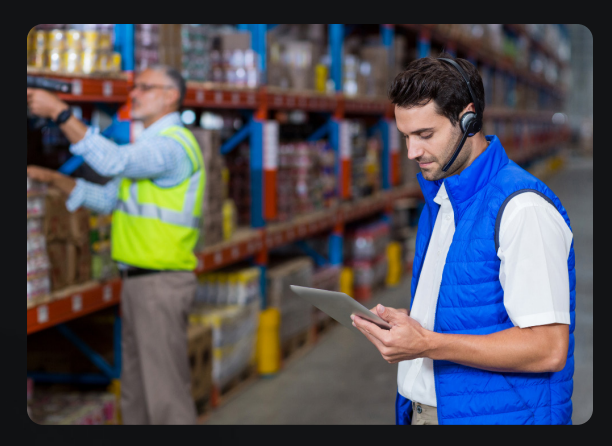
Provides real-time access to remote experts, reducing the need for on-site visits and saving time and costs associated with dispatching technicians to the field.

Mixed Reality Expert Guidance (MREG) is an augmented reality (AR) enhanced secure remote video support tool connecting field technicians to Subject Matter Experts. MREG significantly reduces work execution time by providing guidance from experienced workers on demand and avoiding workers leaving work sites to resolve issues.